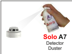
Solo A7 Detector Duster