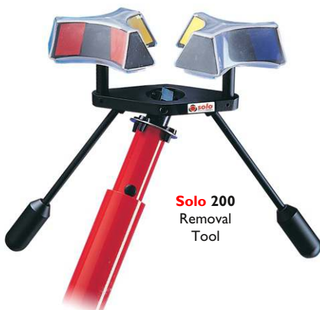
Solo 200 Removal Tool