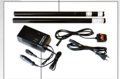
Solo 725 Fast Charger