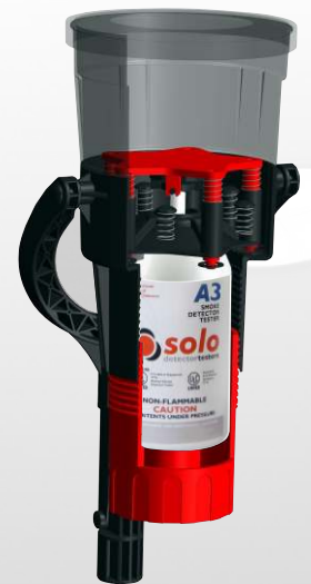
Solo 330 for use with Solo A3 & C3 Aerosols

Solo 332 is available for larger diameter detectors.